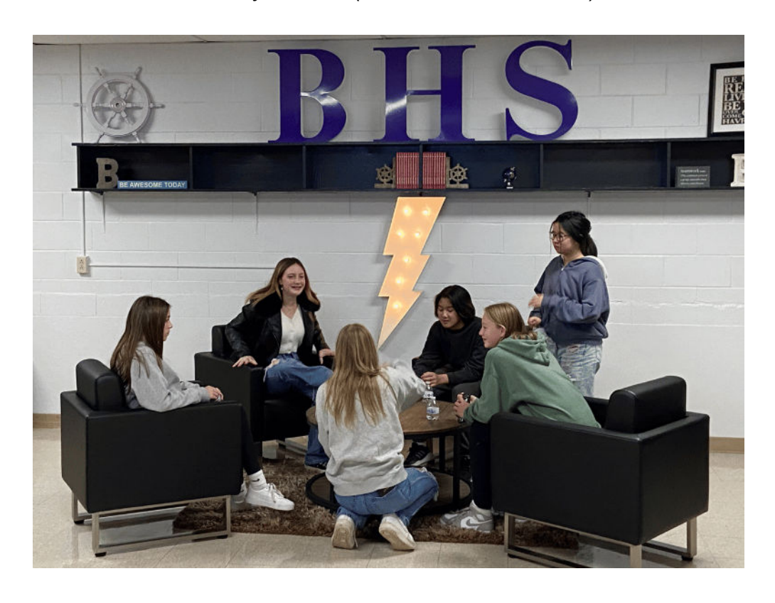
Students hang out in the lounge area inside Bourne High School's new Business Suite during the open house event on Tuesday, Nov. 29.