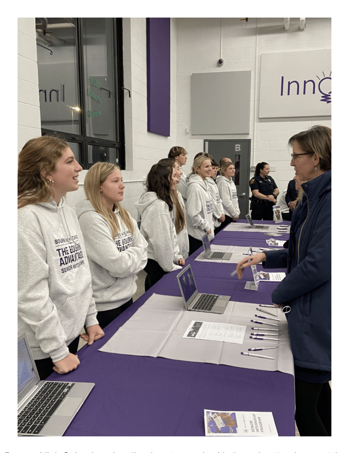
Bourne High School seniors lined up to speak with those in attendance at the Innovation Pathways Open House about their internships on Tuesday, Nov. 29.