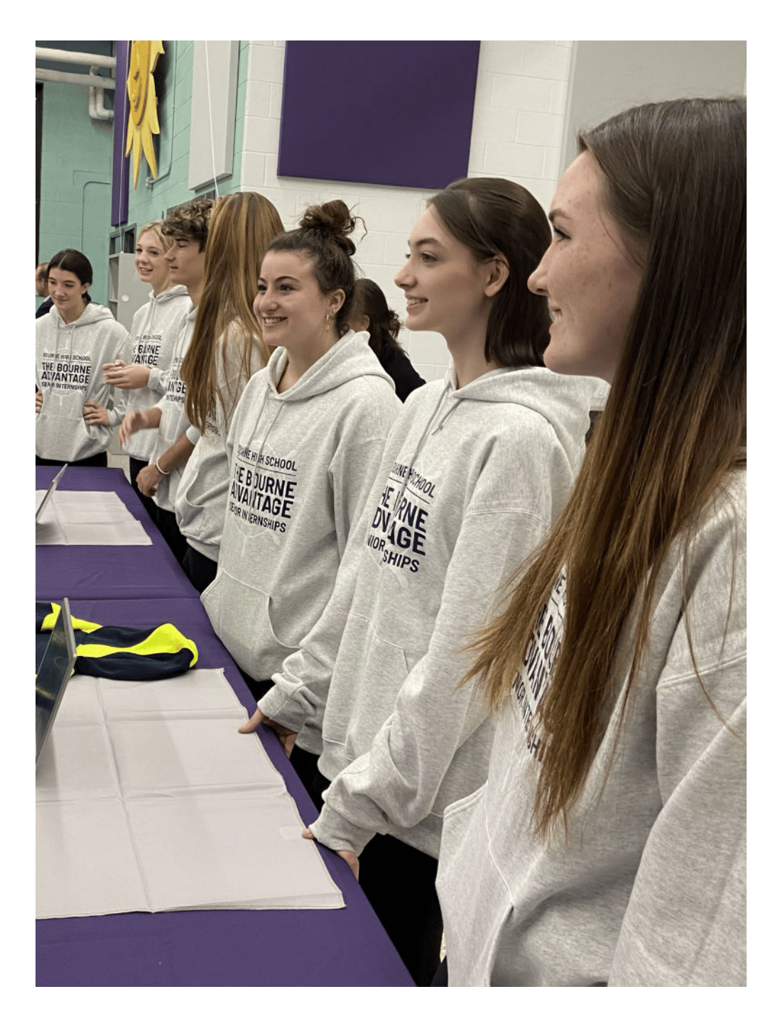
Senior interns were all smiles as they spoke to open house attendees about their experiences.