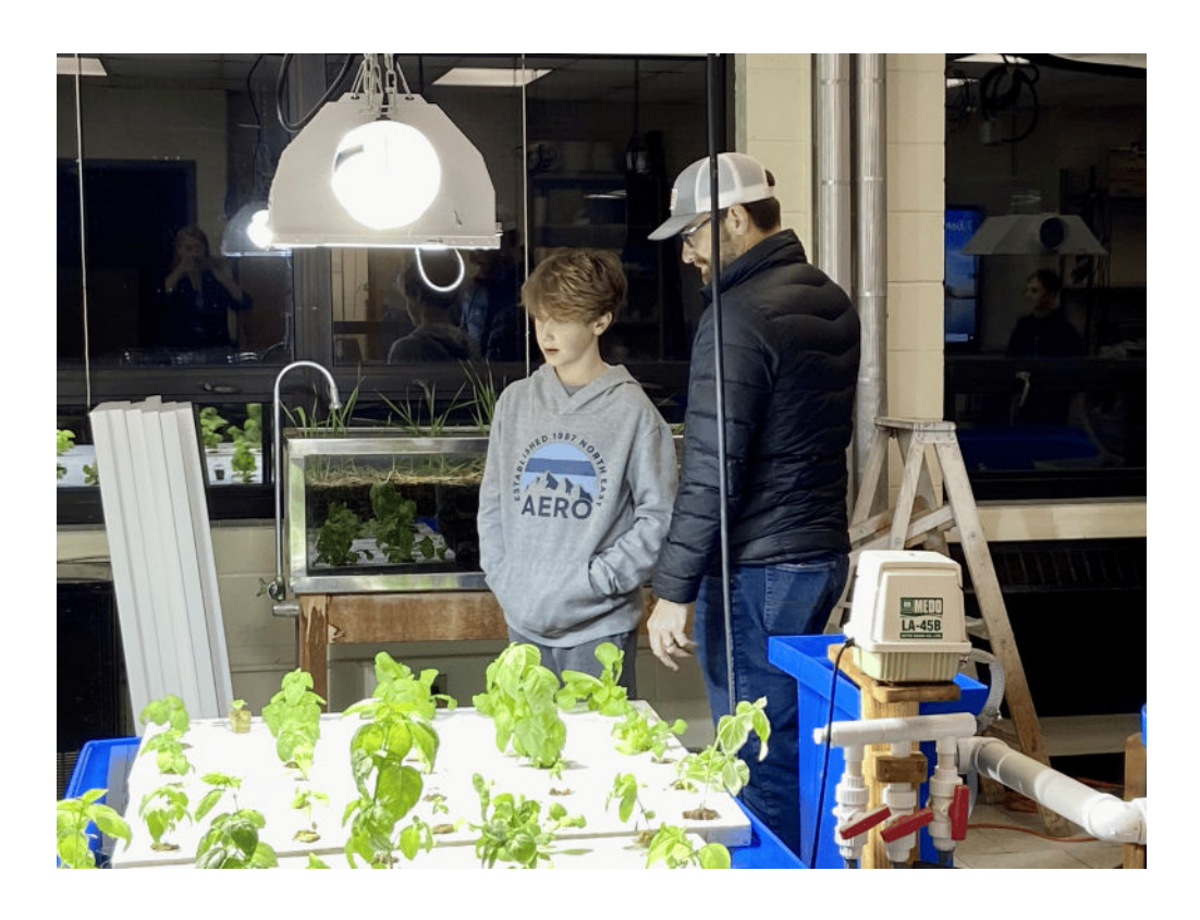
The Sustainable Living Aquaponics Lab was on display during the open house event on Tuesday, Dec. 5. (Bourne Public Schools)