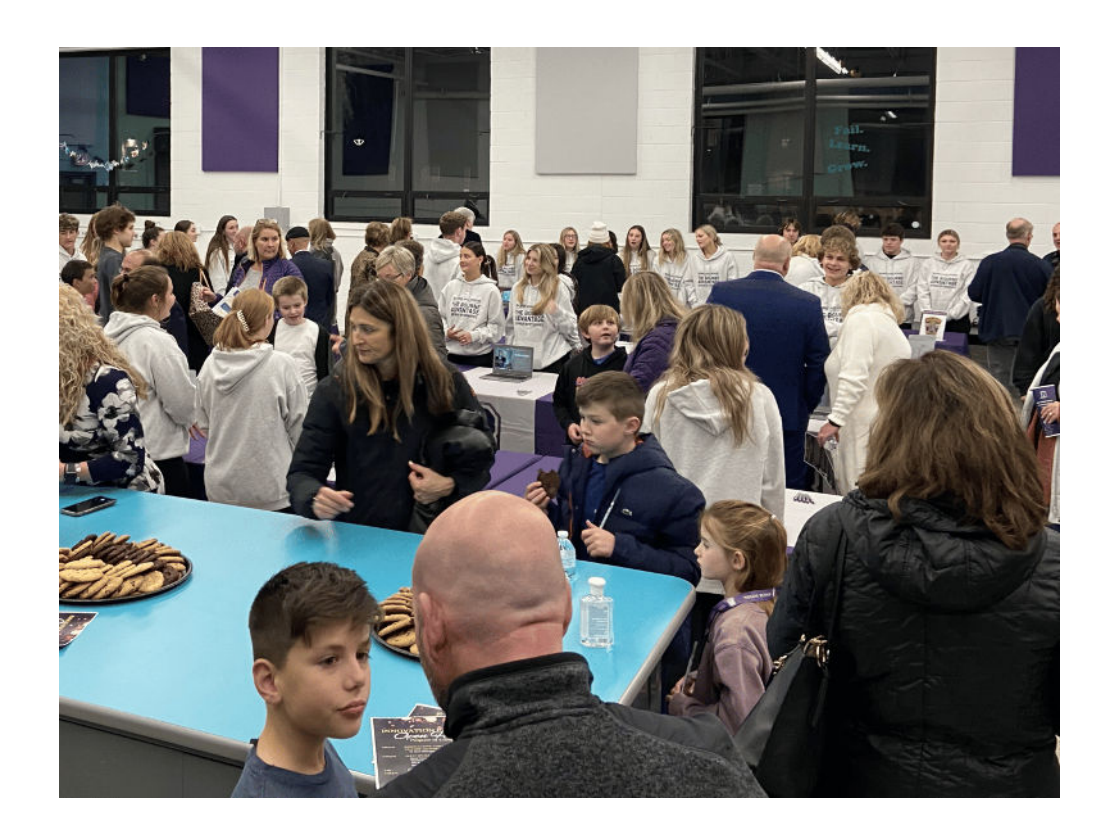
Over 300 people attended the event to showcase the district's Innovation Pathways programs.